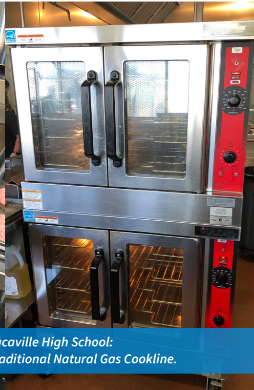
Vacaville High School: Traditional Natural Gas Cookline.

The table below summarizes the results of the field study. While the normalized utility cost of the electric cookline was higher than the traditional line, the added benefits of the combi ovens and the advanced tilt skillet help Will C. Wood HS bridge the operating cost gap between the two cooklines. These pieces are highly productive, programmable, and self-cleaning resulting in significant labor cost savings. The “kitchen of the future” cookline at Will C. Wood used less than half the energy per 100 meals served than Vacaville HS’s legacy natural gas cookline. Considering the measured daily energy use per square foot of cookline, Vacaville High School again used nearly double the energy of Will C. Wood. This difference is attributable to the higher energy efficiencies in electric cooking equipment versus natural gas, which is 2 to 3 times more energy intensive on average.