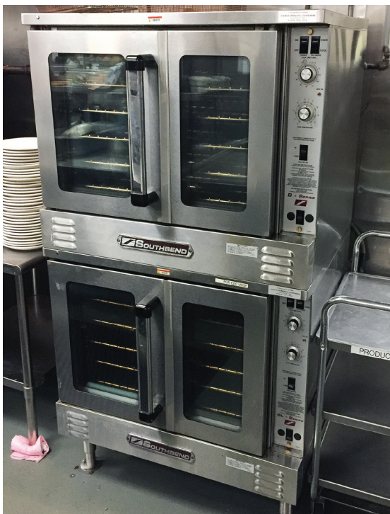
ENERGY STAR convection oven (Unit B)