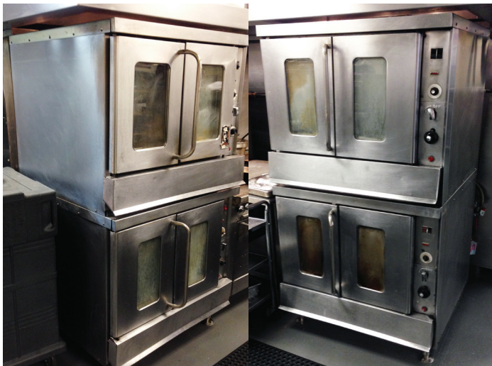
Pre-makeover convection ovens (Units A & B)

The Moffitt Café serves as the Medical Centers' main dining facility serving breakfast, lunch, and dinner for dining room patrons and room service from 7 am to 7 pm daily.