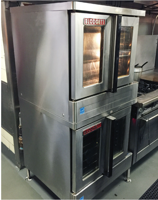
ENERGY STAR convection oven (Unit A)